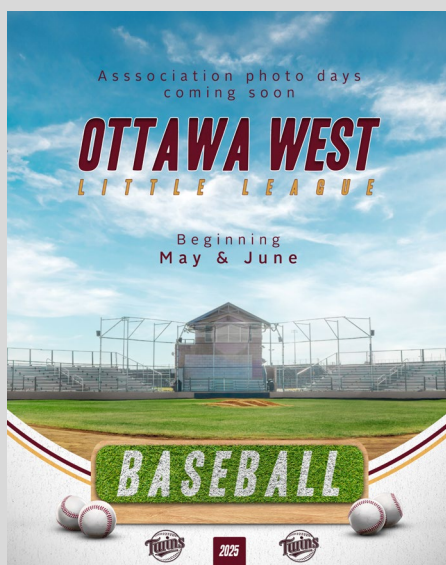
Photo days will likely be mid-May

If parents have any questions, they can reach out to their child's coach.